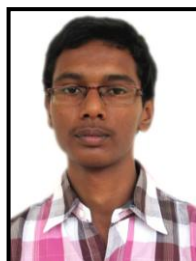
GATE SCORE: 498 ALL INDIA RANK: 4118