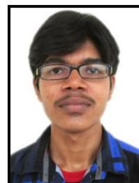
GATE SCORE: 359 ALL INDIA RANK: 11279