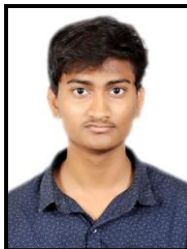
144G1A0578 Certification Grade - Successfully completed