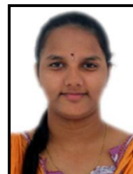
144G1A0599 Certification Grade - Elite