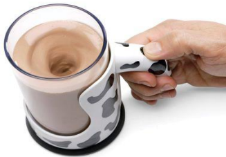
Fig: Automatic coffee mixture

Finally, we can say that technology makes life easier, it saves time, it provides information, and it brings awareness. Today, our society is driven by technology and it is an addiction to modern generation. I firmly believe technology is purchased more as a fashion statement.