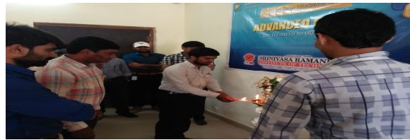
A Three days workshop on “Python (Phase-II)”