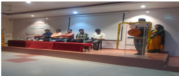
A Two day workshop on “Ethical Hacking”